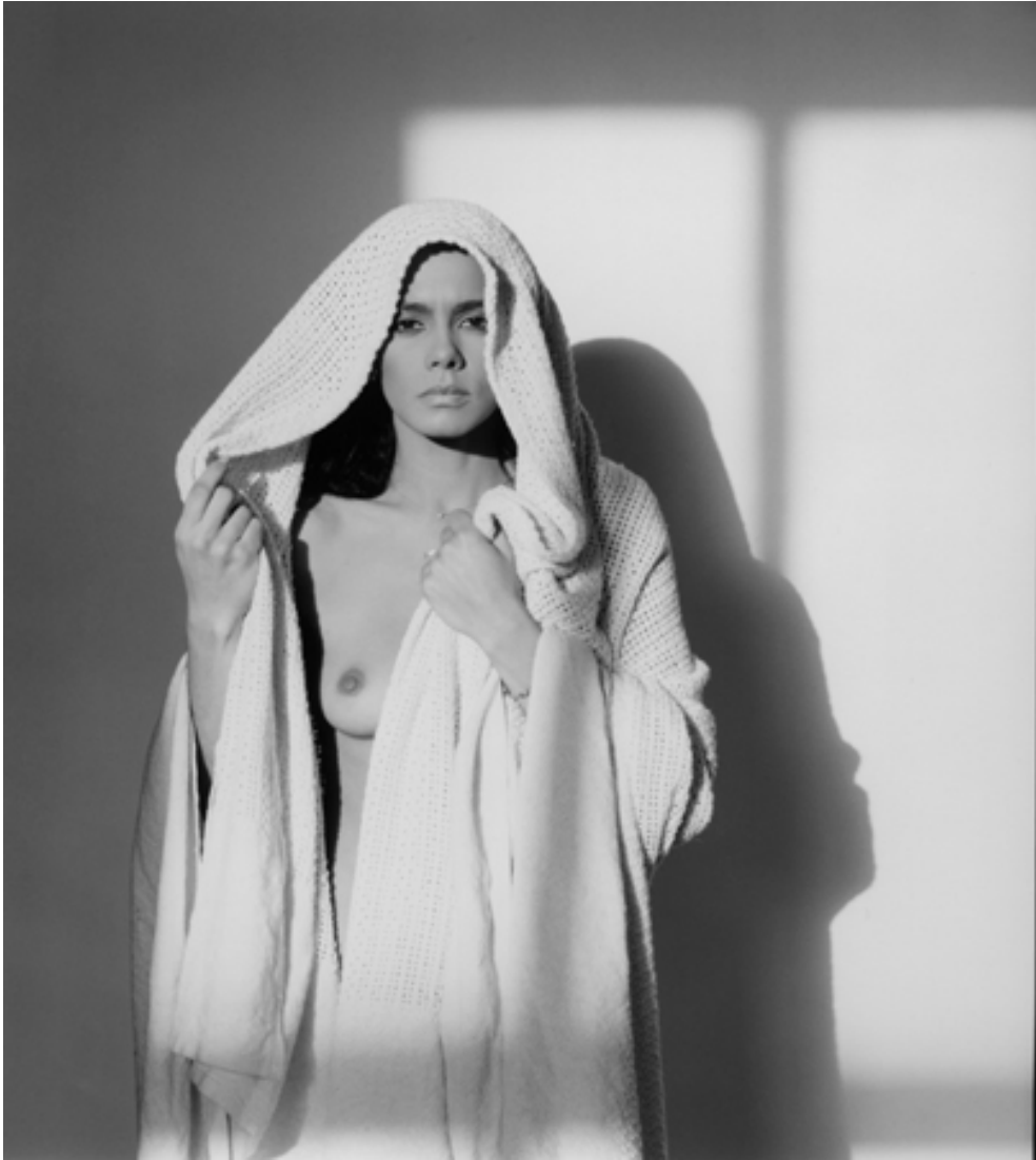
Maybelle 1982 Silver gelatin print 48,5 x 38,5 cm