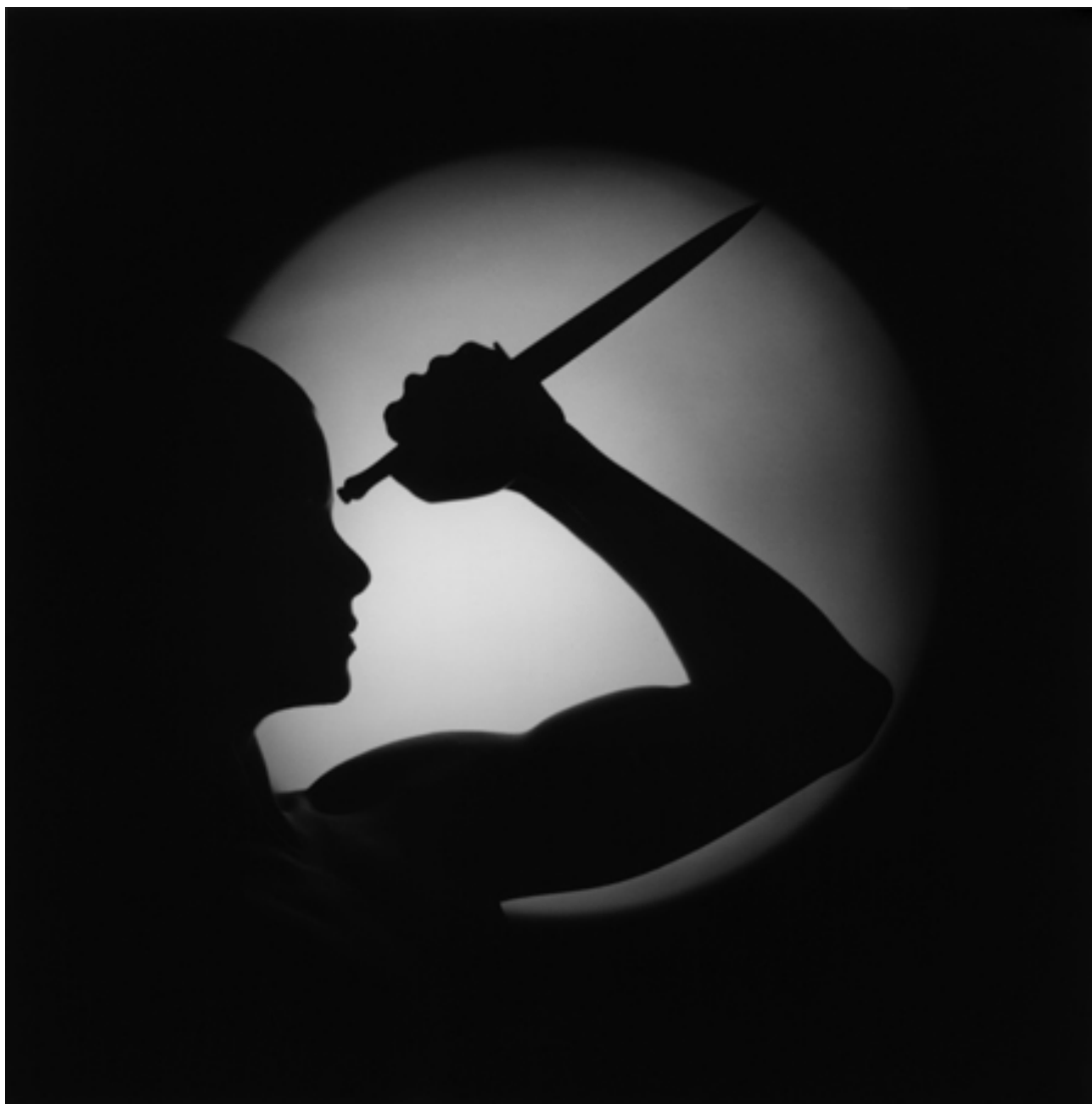
Lisa Lyon 1982 Silver gelatin print 38,5 x 38,5 cm