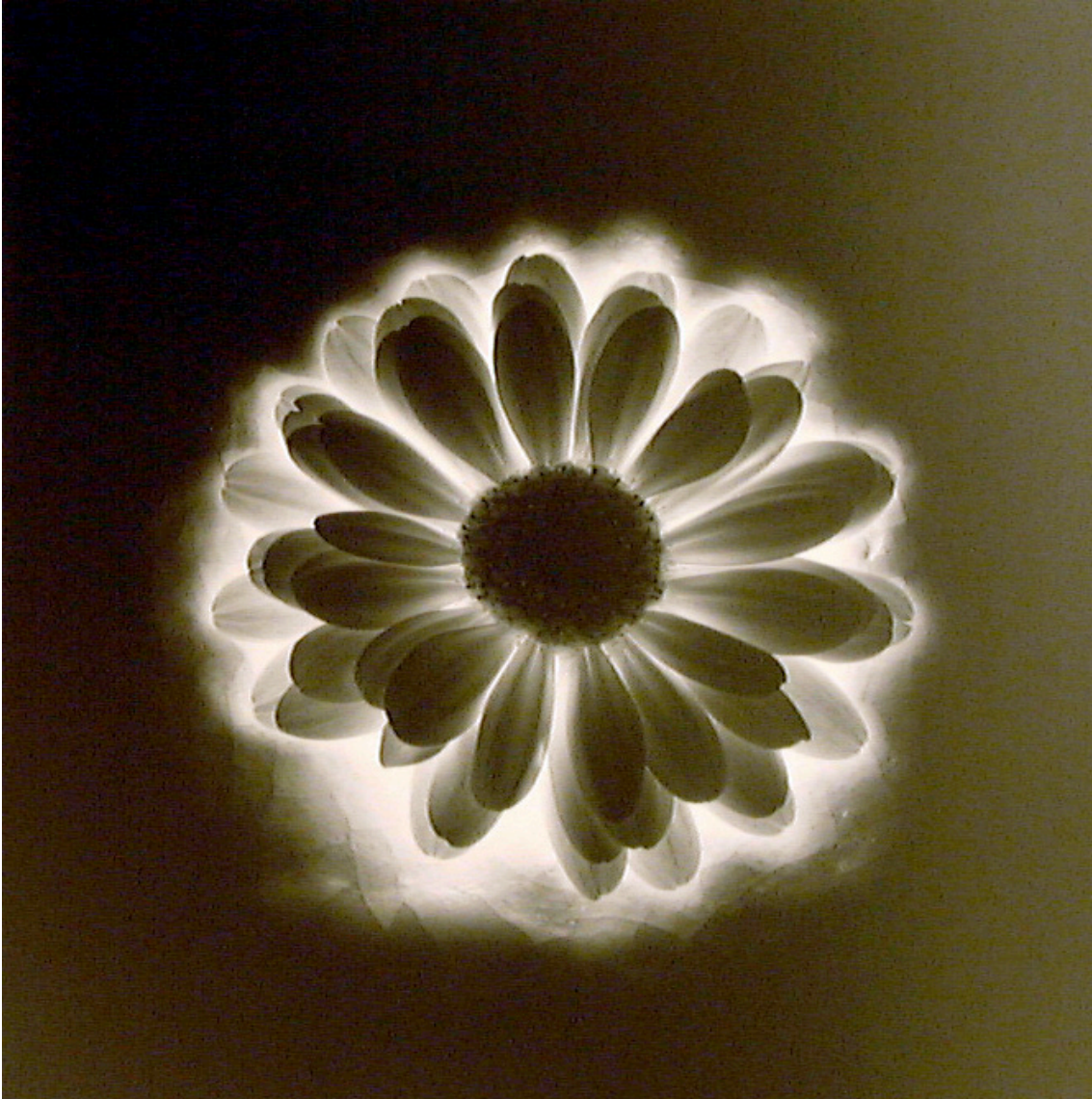
Margarita 1985 Silver gelatin print 50 x 40 cm