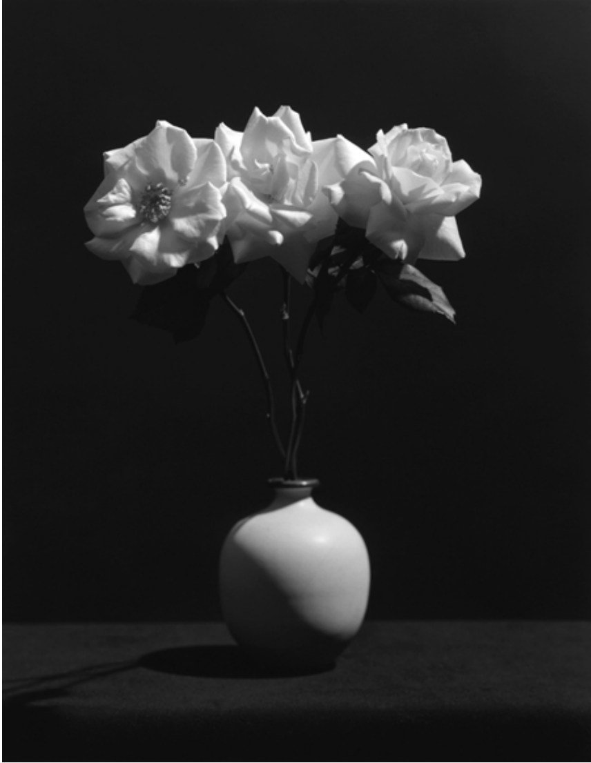
Rose 1983 Silver gelatin print 48 x 38 cm