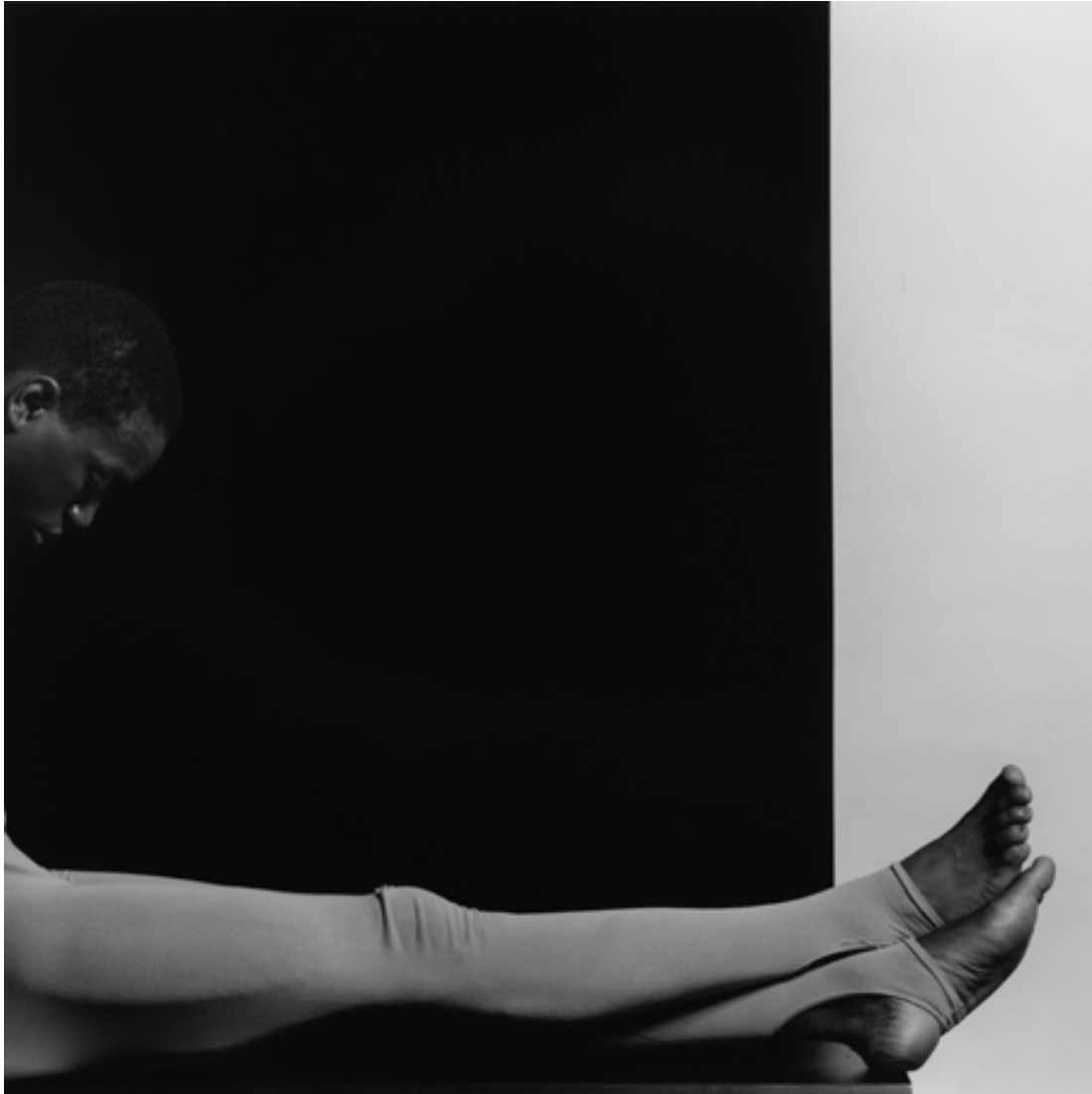
Clifton 1981 Silver gelatin print 38,5 x 38 cm