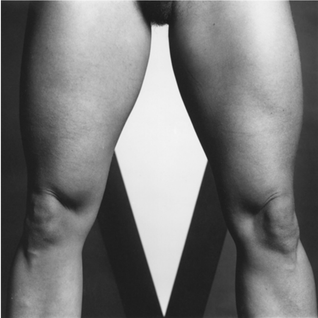
Lisa Lyon 1980 Silver gelatin print 35 x 35,5 cm