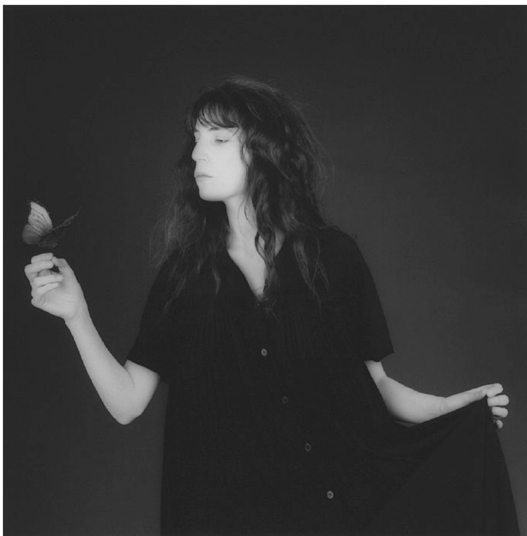
Patty Smith 1987 Silver gelatin print 51 x 61 cm