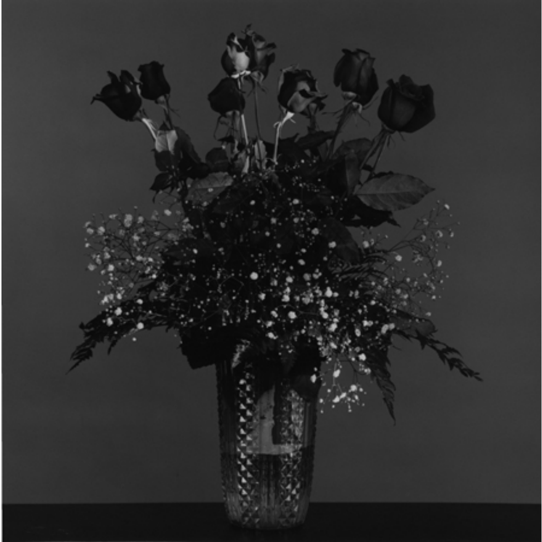
Rose 1982 Silver gelatin print 38 x 38 cm