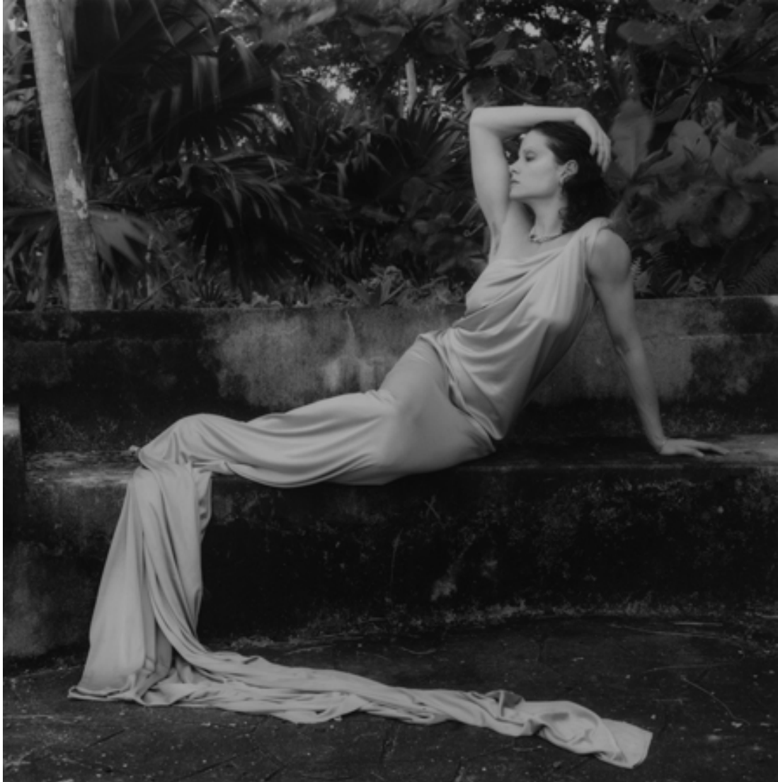
Lisa Lyon 1982 Silver gelatin print 38,5 x 38,5 cm