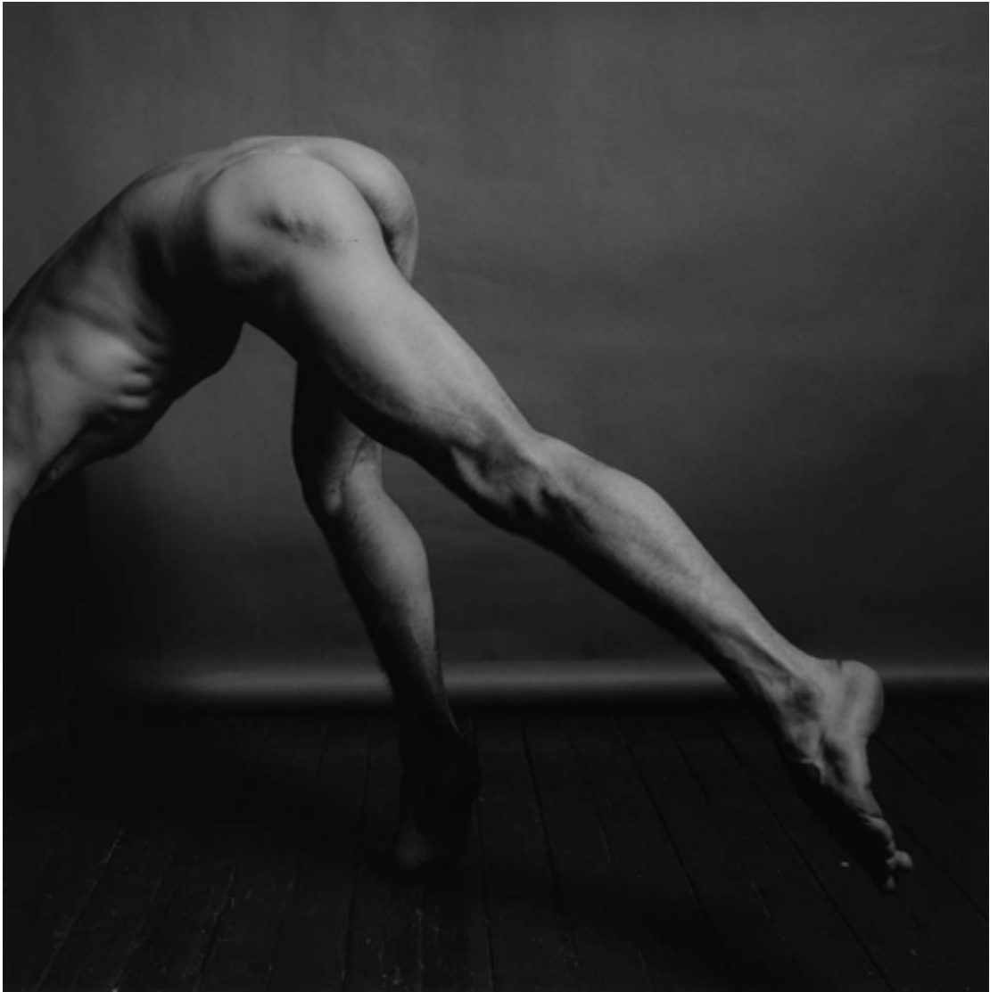
Philip 1979 Silver gelatin print 35 x 35 cm