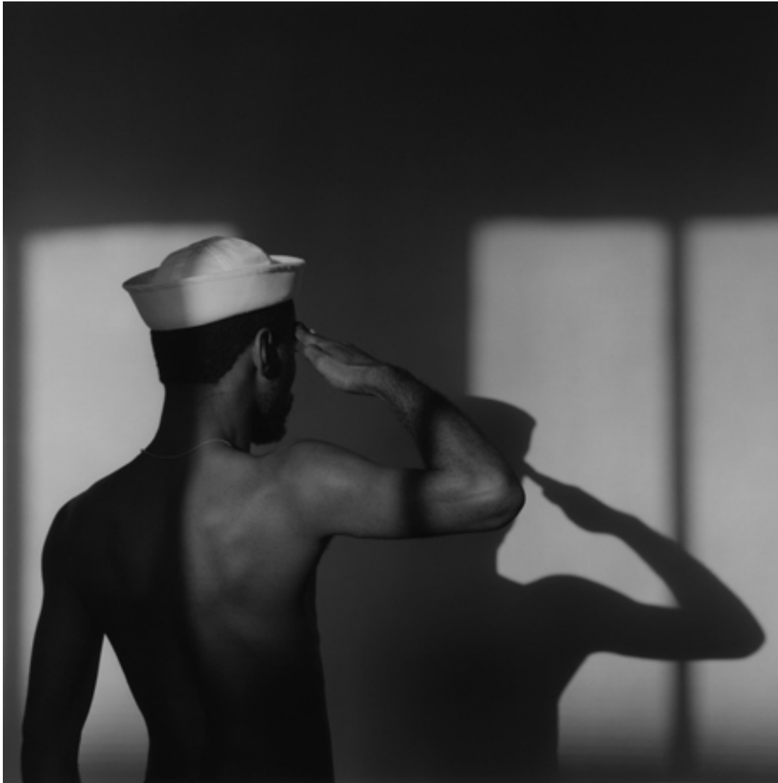
Jack Walls 1982 Silver gelatin print 38,5 x 48 cm