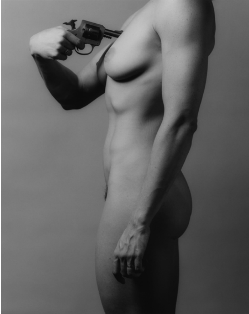
Lisa Lyon 1982 Silver gelatin print 48,5 x 38,5 cm