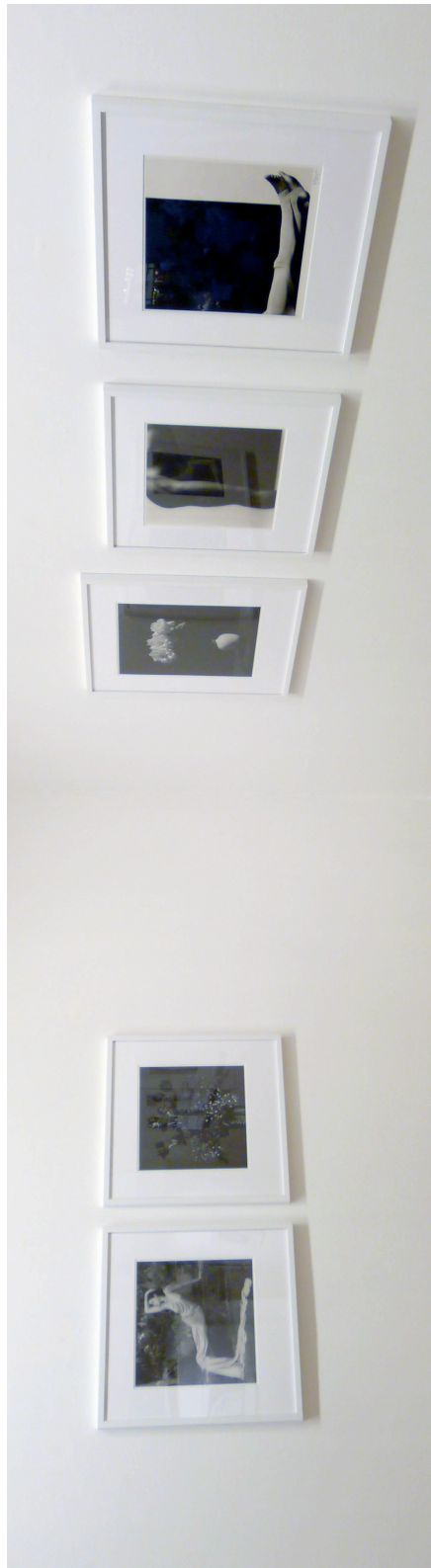
Exhibition view September 2012