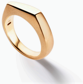
Ring in pink gold, engraved "REPOSSI/ROBERT MAPPLETHORPE"

Inspired by a picture of Robert Mapplethorpe's friend, these three pieces are unique in their polishing, which is both mirror-polished and brushed to reach this particular "patina" effect. Diving into the Repossi universe, the overexposed bar from the Berbere collection is recognizable in the triple ring and the sharp angles from the Antifer collection is seen in all three creations.