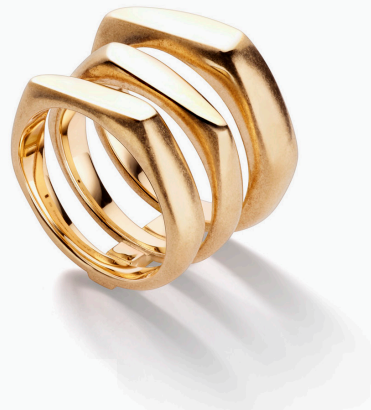
Triple ring in pink gold, engraved "REPOSSI/ROBERT MAPPLETHORPE"