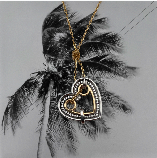
Puerto Rico, 1981

The Mechanic ring, resembling a motor, is a technical construction with several hinges allowing the ring to move. This mobility is inspired by one of the necklaces created by Mapplethorpe. This creation is the epitome of craftsmanship and authentic to Repossi.