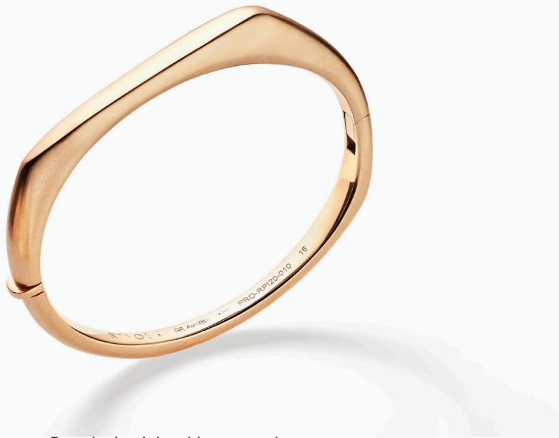
Bracelet in pink gold, engraved "REPOSSI/ROBERT MAPPLETHORPE"